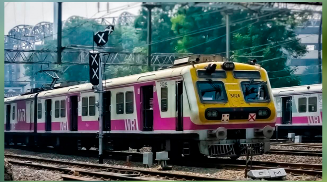
DAHANU STATION - 5KM