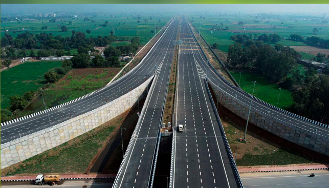
MUMBAI DELHI EXPRESSWAY